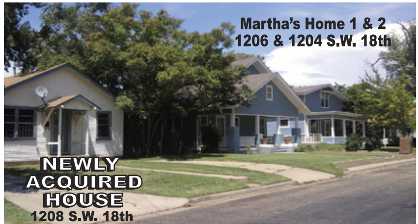
Not pictured is Martha's Home 3 at 1210 S.W. 18th to the west of the newly acquired house.

Many thanks to the many individual donors, foundations, restaurants, ProNews 7, and all who aided in our fundraising efforts!